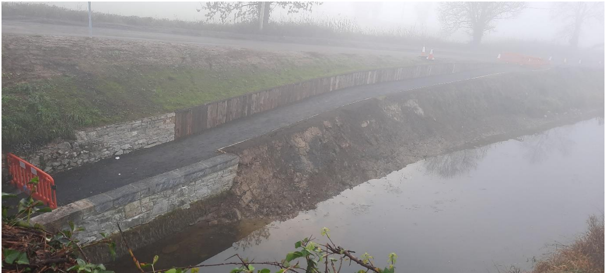
Clogheen Bridge – Works Complete end March