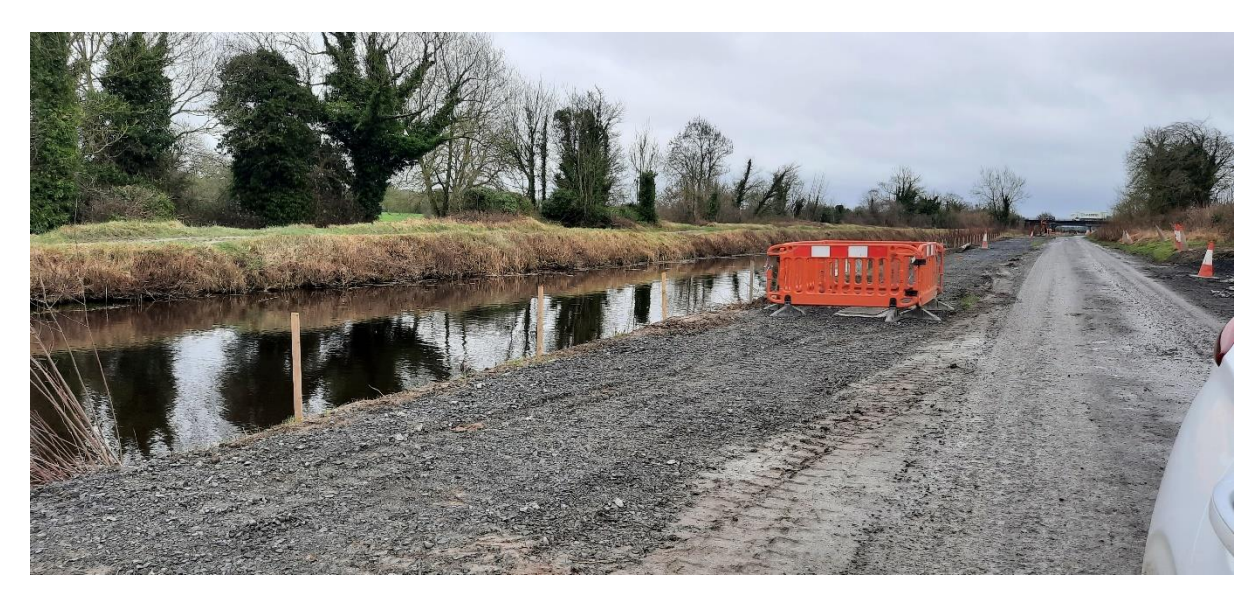
Update March 2024 M7 Underpass towpath works ongoing, Works to be complete end March