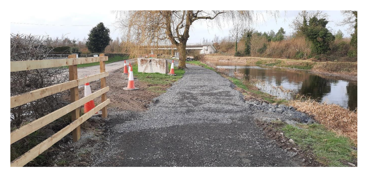
Rathangan – 2 separate locations Works complete mid April.