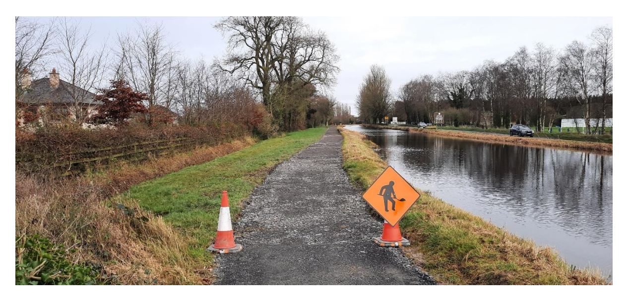
Ummeras Bridge – Works complete end of March